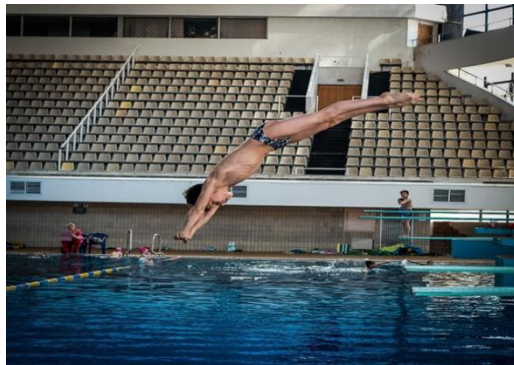
Fig. 1 – Air Friction Acts Upward on the Diver

What forces are acting on the diver in Figure 1? Gravity is pulling the diver down. A frictional force is opposing the diver's fall. But the force is too small to slow the diver down. When the diver hits the water, however, the diver slows down and stops before hitting bottom. How does water break a fall?