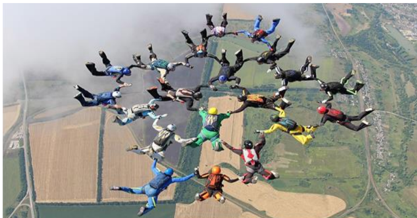
Fig. 3 – Falling Sky Divers

acceleration. When the forces are balanced, the sky divers fall at a constant speed. Meteorites, spacecraft, and other objects reach a constant speed as they fall to earth. The constant speed a falling object reaches when air resistance balances gravity is called terminal speed [3].