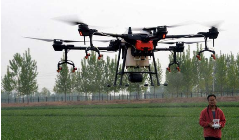
Figure 3– Remote control of drones

The drone sprays chemical fertilizer on the plant leaves. Fertilizers are applied immediately after sowing. Insecticides prevent animals or insects from invading farmland. And while people are at risk of various diseases as a result of contact with insecticides, drones are not affected by them.