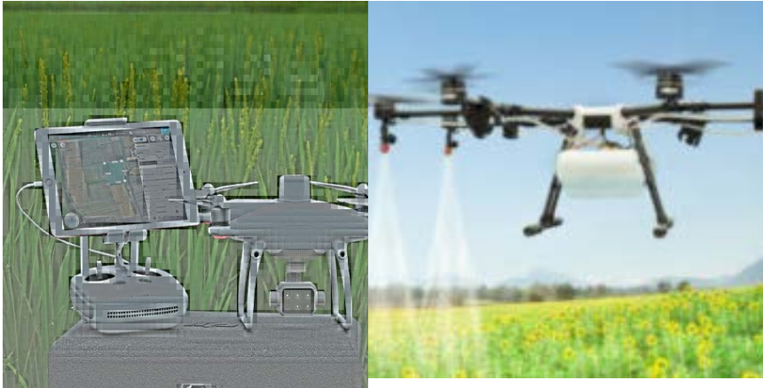
Figure 2 – Drone control

to prevent potential losses caused by disease or bad weather. They know that we take into account all the challenges that can arise when using drones. Technical analysts are aware of the nature of the problems associated with drone use. Experts conduct various studies to avoid similar problems recurring in the future.