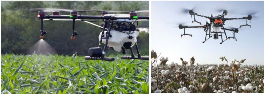
Figure 1 – Work performed by drones

A brief overview of the advantages and disadvantages of using drones in agriculture.