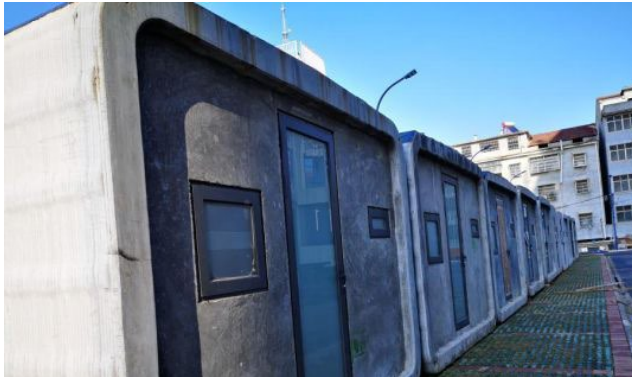
Figure. 3. 3D printed isolation ward in Xianning Central Hospital in Hubei, China