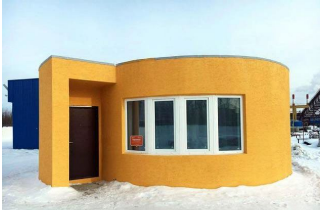
Figure 1. 3D printing house in Russia by Apis Cor company, Russia