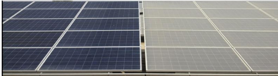
Figure 1 – Impact of dust on solar panels

when we deal with the environmental factor. In this case it affects the PV system generated output power due to the reduction of the solar irradiance when an accumulation of dust particles starts to build up on the solar panels. Other parameters may be considered as well, however are not considered in this paper such as shading, humidity and so forth (fig. 1). Shows how the impact of dust particles accumulate on a solar panel.