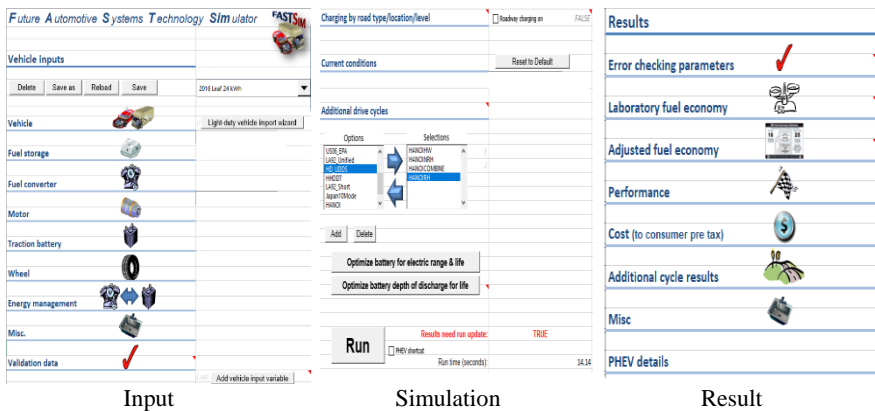
Figure 1 – FASTSim interface

FASTSim (Future Automotive Systems Technology Simulator) is a high-level advanced vehicle powertrain systems analysis tool supported by the U.S. Department of Energy's Vehicle Technologies Office. FASTSim has been validated for hundreds of vehicles and most existing powertrain options [4]. The input data for most light-duty vehicles can be automatically imported. Those inputs can be modified to represent variations of the vehicle or powertrain. The vehicle and its components are then simulated through speed-versus-time DCs. At each time step, FASTSim accounts for drag, acceleration, ascent, rolling resistance, each powertrain component's efficiency and power limits, and regenerative braking.