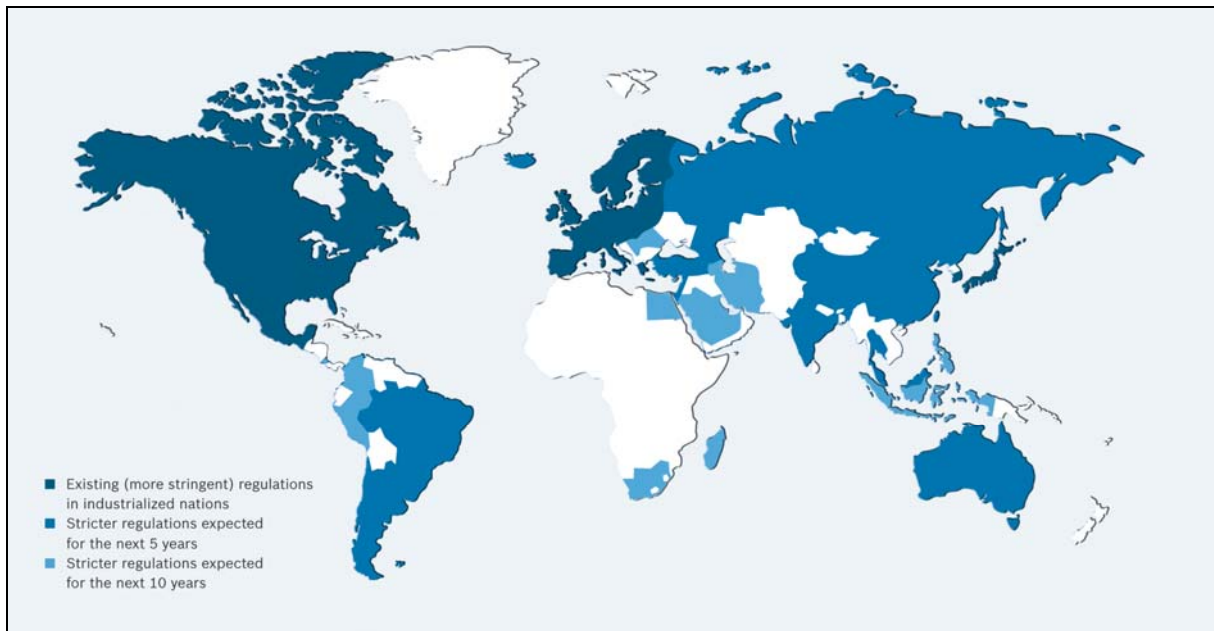
Figure1: Strict emission regulations world wide

In Europe, the Euro 5 standards, and from 2013 Euro 6, stipulate extremely strict limits for trucks and buses, so-called on-highway commercial vehicles. For mobile equipment (off-highway vehicles), emission legislation Tier 3 and in future Tier 4 apply, which also drastically reduce the permissible limits for particulate and nitric oxide emissions. On the world map Figure1 the blue coloured areas show the strict regulations worldwide which are valid today, in 5 years or 10 years.