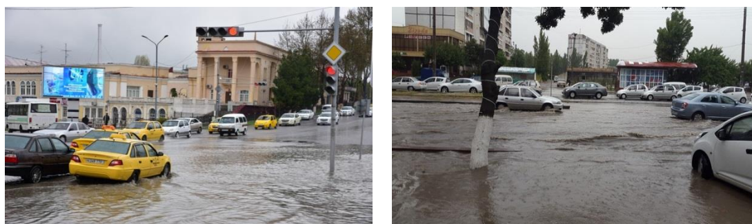
Figure 1. Rainfall on the streets of Tashkent and Samarkand

One of the main problems is the improvement of the system of water disposal and implementation of advanced international experience in this area, taking into account the reliable and long-term use of water disposal systems in the design and construction of urban roads.