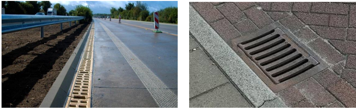
Figure 3. Modern water intake (Germany)

The most modern surface water disposal system is a closed sewage disposal system that meets the highest standards of the city. The construction of multistoried buildings in microdistricts, especially in large cities, is unthinkable without the sewage disposal of surface water. In this case, it is unwise to exclude water from an open system as the anchors do not have access to rainwater from a large area. However, it is important to remember that even in a closed drainage system, some of the water is deposited on the surface.