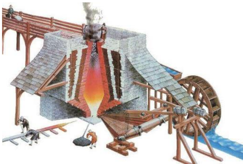
Figure 1 – Stukofen

In the Middle ages, the height of the melting furnaces was already three meters, and they worked using energy obtained through water. These furnaces were called stukofen and became an incentive for the iron and steel industry to enter the next round of development.