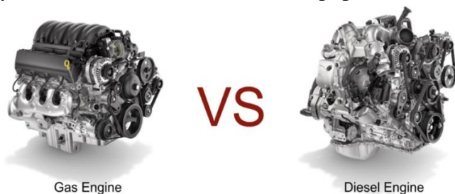
Figure 2 – Comparison of Gas Engine and Diesel Engine

petrol has some advantages, and one of them is the absence of need of additives even at very low temperature. Talking about diesel fuel is a completely different story? Also, the petrol one is easier to start in winter and requires less time to warm up. Another essential factor is noise and engine vibrations. Speaking of which, petrol engines are much more advantageous than diesel ones. The issue of diesel engines that significantly increases vibrations and causes rumbling that can't be silenced by any soundproof or dampers is the process of ignition being under a lot of pressure. In terms of fire safety, petrol engines are more prone to fire and explosions. Therefore, it requires more attention to leak proofness of the fuel system and condition of electrical equipment [2].