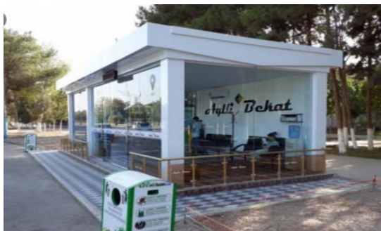
Fig. 1. Innovative stop in the city of Termez

At this kind of stops information about the number of people is collected and analyzed, which is important for estimating the passenger flow and timetable of passenger transport. There is a possibility of obtaining operational information about cases of violations of public order. Solar panels installed at the innovative stop provide lighting and electricity to USB ports for charging phones. Some stops can be equipped with trade and service points (Fig. 1).