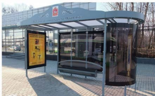
Fig. 2. Innovative stop for public transport

he company «XXI Century-TV» has developed an innovative stop for public transport (Fig. 2).