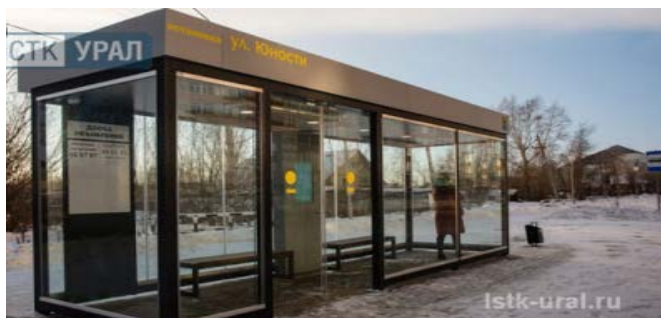
Fig. 3. Smart Stop - LSTC - Ural (Chelyabinsk)

LLC «LSTK-Ural» is a manufacturer of innovative stop pavilions and interactive sensor systems (Fig. 3).