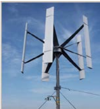
Fig. 5. Vertical five-blade wind turbine generator with an airplane wing profile

Solar panels are installed on the roof of the bus stop. As an additional source of electrical energy a wind generator can be used. For the best use of wind energy a wind turbine of the vertical type is proposed (Fig. 5). The advantages of the vertical wind turbine are considered to be an increased service life and lower noise. At the same time, they have on average twice the service life and half the noise level.